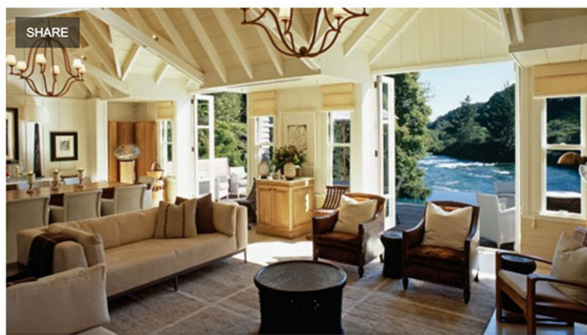
Owner's Cottage, Huka Lodge.