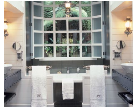
Junior Lodge Suite, bathroom