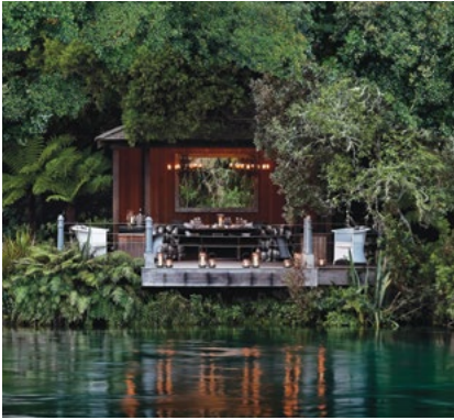
Dining in the Jetty Pavilion