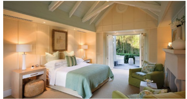
Alan Pye Cottage