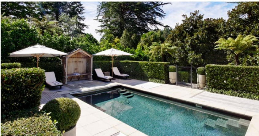
Swimming and spa pools within the grounds