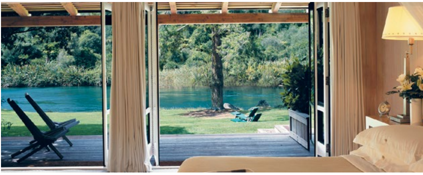
Junior Lodge Suite