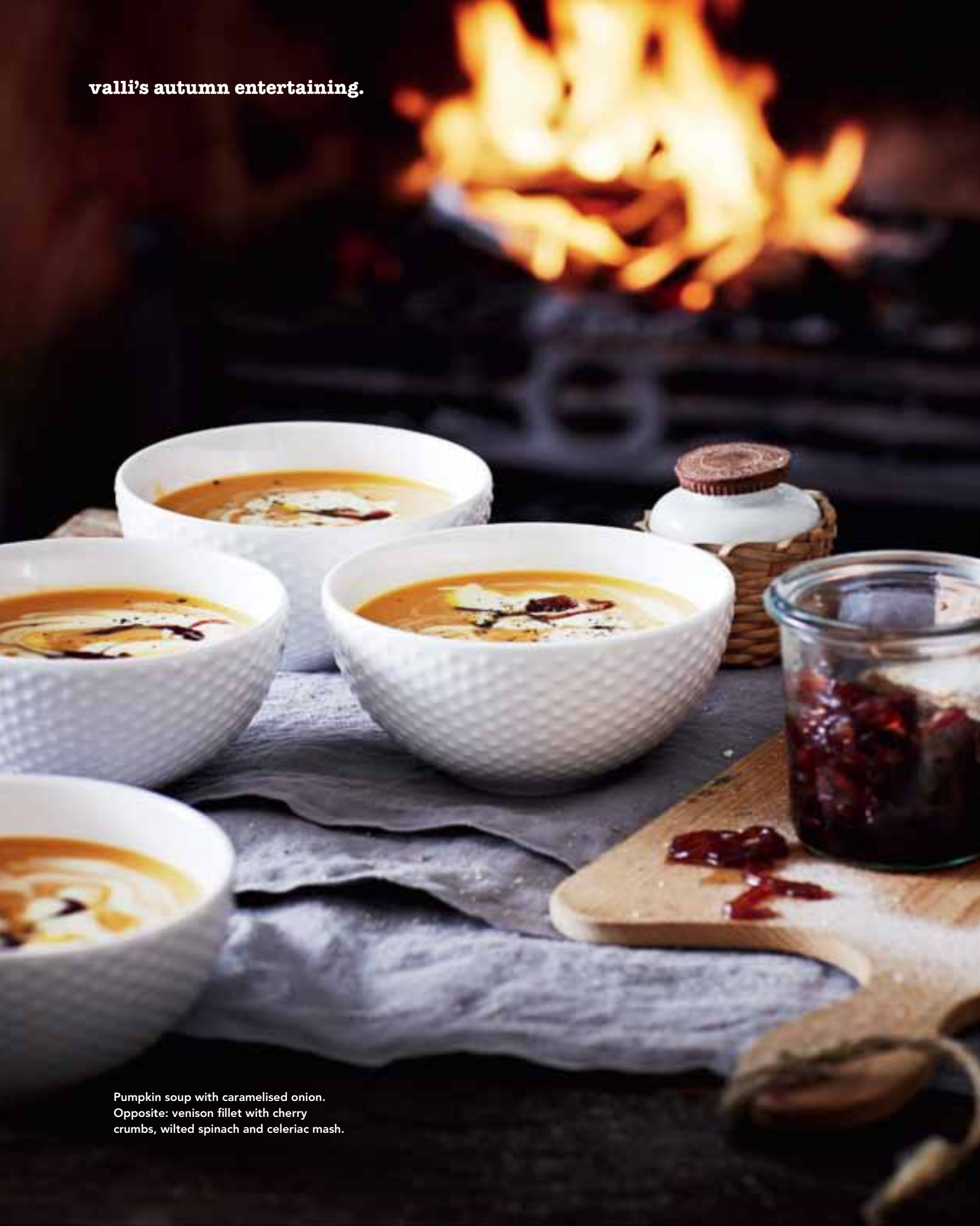
Pumpkin soup with caramelised onion. Opposite: venison fillet with cherry crums, wilted spinach and celeriac mash.