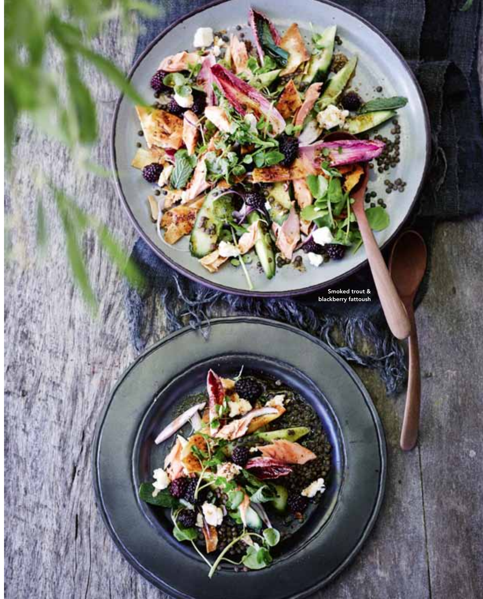
Smoked trout & blackberry fattoush

RECIPES VALLI LITTLE STYLING DAVID MORGAN SHOT ON LOCATION AT HUKA LODGE (HUKALODGE.CO.NZ). Grey tablecloth and napkins (used throughout) from Ondene (Double Bay NSW, ondene.com).