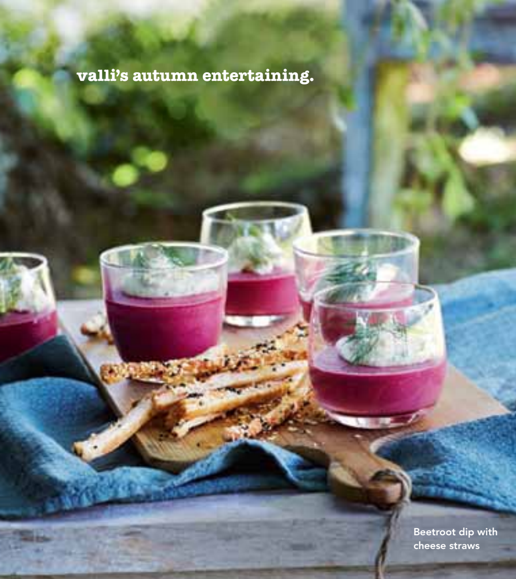
Beetroot dip with cheese straws

These produce-driven entertaining menus are inspired by the natural bounty at Huka Lodge.