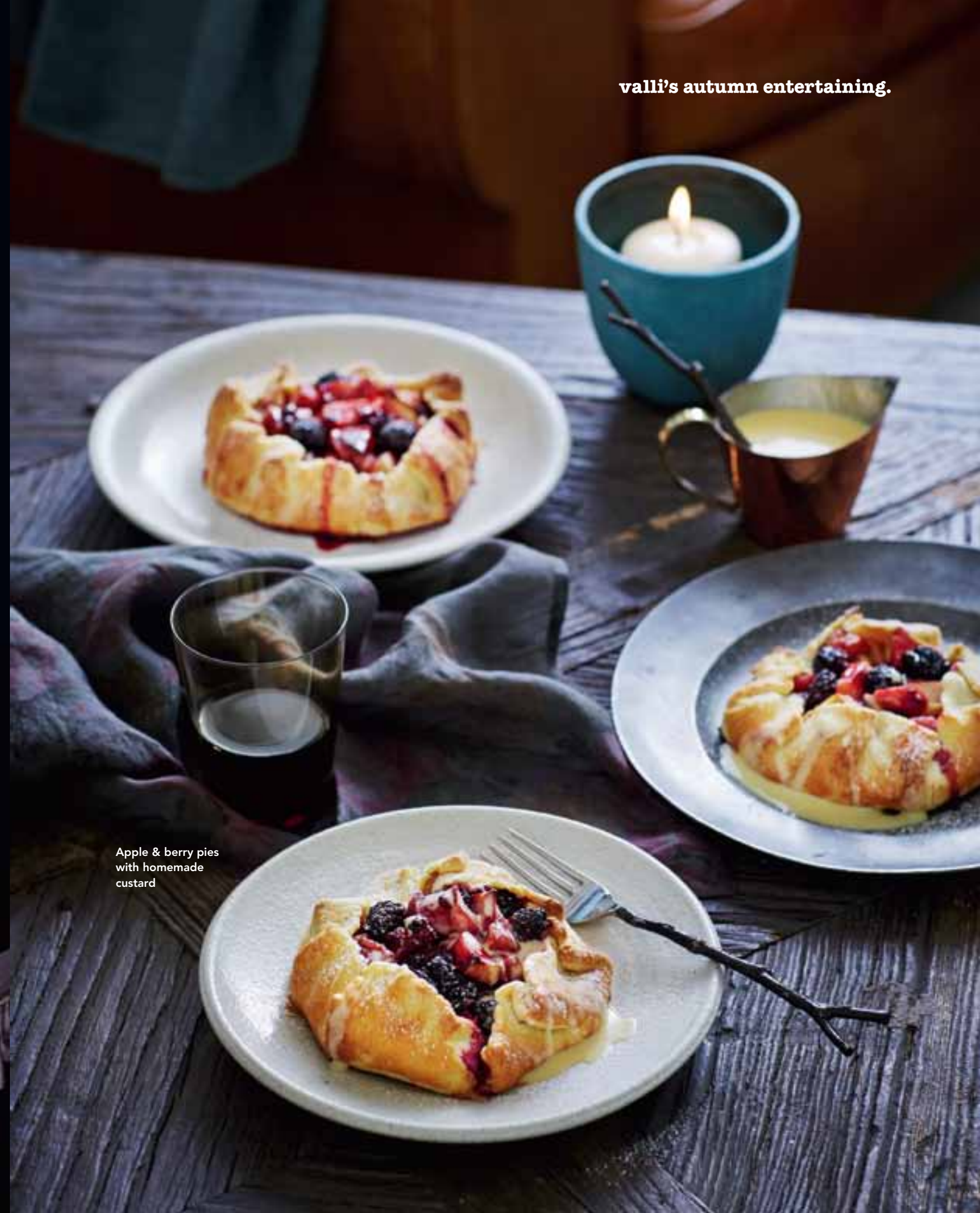
Apple & berry pies with homemade custard