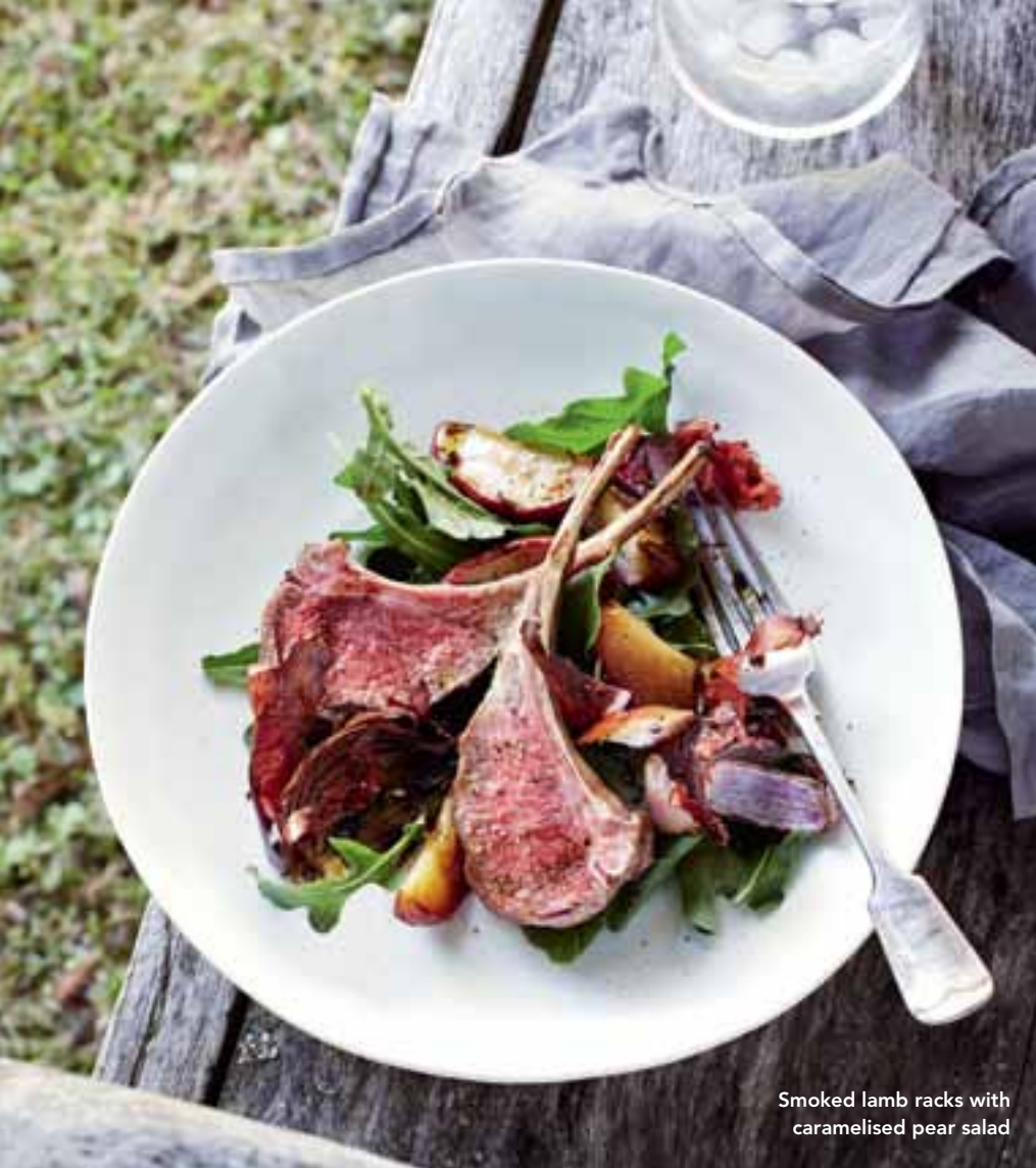
Smoked lamb racks with caramelised pear salad

tea and sugar, then spread over foil. Sit a wire rack over foil and place lamb on top. Cover pan with 2 sheets of foil, sealing well. Place over low heat and smoke lamb for 10-15 minutes.